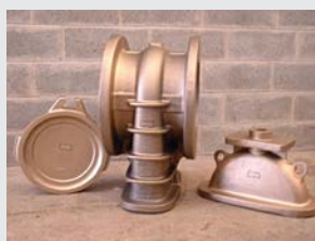
Figure 4: Gate Valve/Butterfly valves.