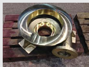
Figure 5: Pre machined cryogenic pump casing.