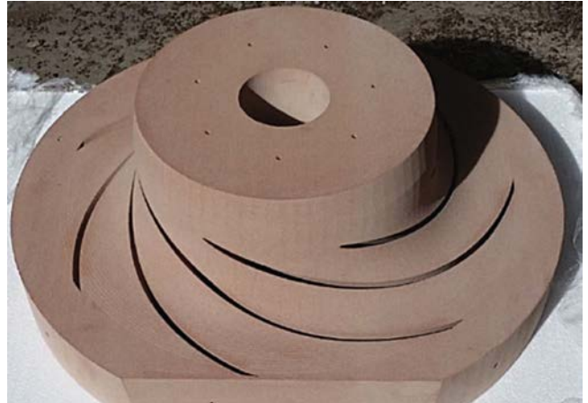
Figure 9: 3D sand printed impeller core.

The field experience gained over the years crossed with the modern 3D simulation software considerably reduces the risks of initial casting. Today's 3D sand printing technology is now available for preparing complex core designs. All of these reasons add up to build good industrial solutions for pump components.