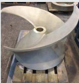
Figure 2: A cast pump impeller.

Here are some examples of parts that can be cast in various aluminium bronze alloys: