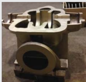
Figure 3: Centrifugal Pump LP Casing.