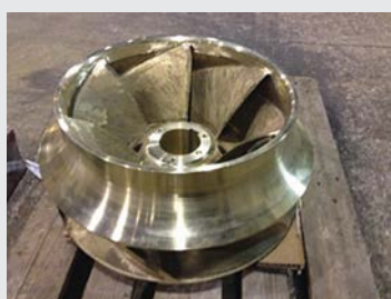
Figure 6: Impellers.