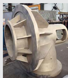
Figure 7: Discharge Elbow.